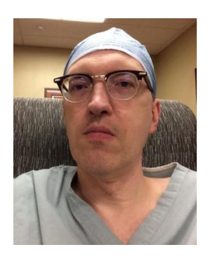
Image: Dr. David Gorski, radical Skeptic on the anti-alternative medicine Science Based Medicine blog often cited on Wikipedia

Energy Medicine "is a branch of alternative medicine based on a pseudo-scientific belief that healers can channel healing energy into a patient and effect positive results... There is no reliable scientific evidence that bioresonance is an accurate indicator of medical conditions or disease or an effective treatment for any condition."